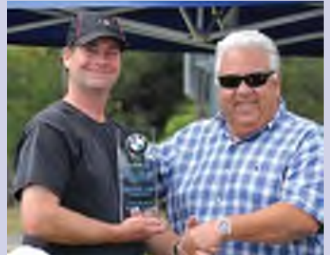
SUPER CLEAN 3 RD Doug Park – 1984 M635