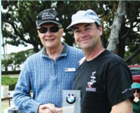
SUPER CLEAN 1 ST Doug Park – 1985 M635