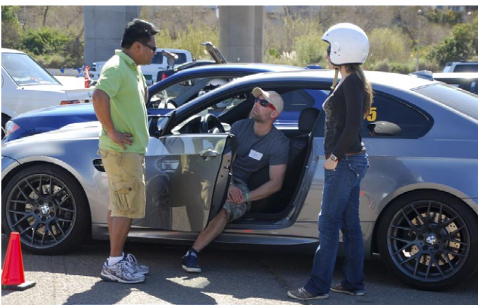
March of Time Autocross March 2, 2013